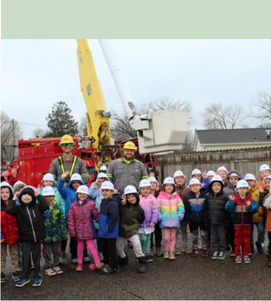
Coldwater Board of Public Utilities, as part of their Project Engage, participated in community events to rebrand their marketing department.

This award recognizes utilities for their promotional efforts in marketing, consumer awareness and branding.