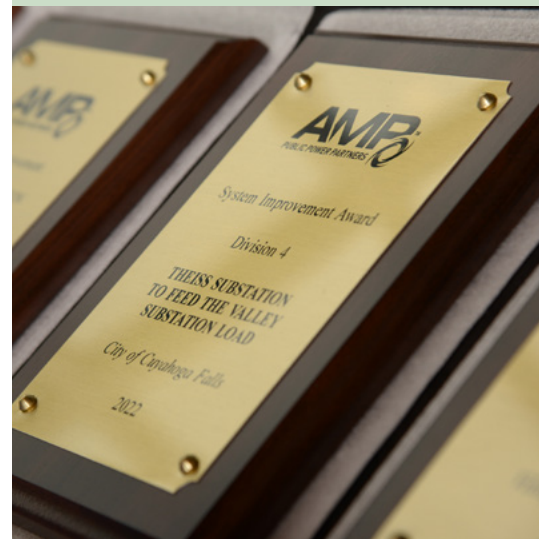
The City of Cuyahoga Falls was awarded a System Improvement Award in 2022 for their Theiss Substation to Feed the Valley Substation Load Project.