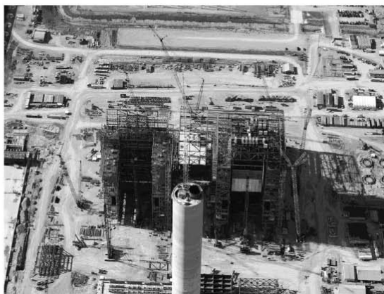
Boiler Erection, Rear View - August 2009