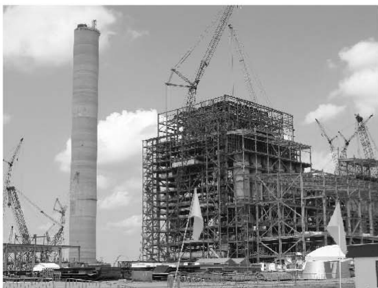
Units 1 and 2 Frontal Views, Late July 2009