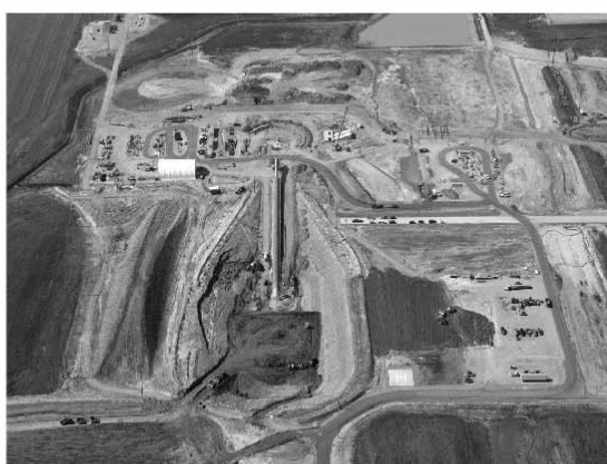
Mine Aerial View, Late June 2009