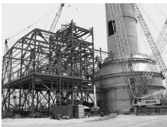
FGD Structure - August 2009