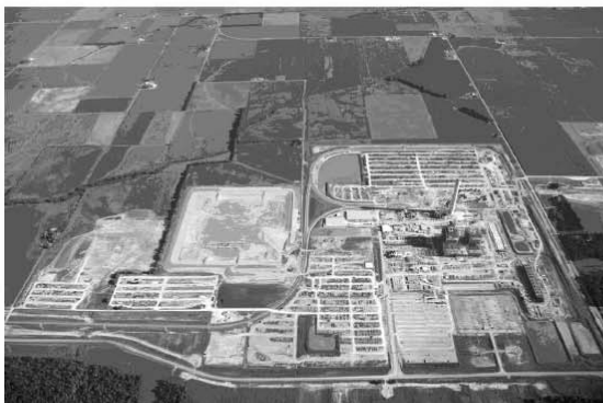
Aerial View, Late August 2009

The following presents recent photographs of the key construction activities at the PSEC.